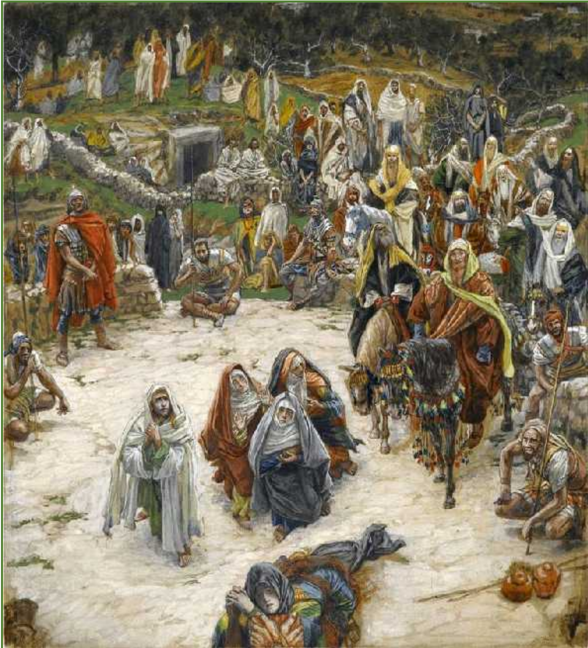
James Tissot 1836-1902

If we could go back in time would these pictures be close in depicting the actual scene?